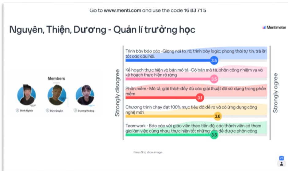
Figure 1. The audience, after asking questions, giving comments and receiving answers from the reporting group, will grade the report group based on the criteria given by the teacher.

To implement the aforementioned peer assessment, teachers used a number of interactive tools such as mentimeter and Discord. Discord (DC) is a free phone or computer chat, video or messaging application. During the group's presentation, students used this tool to ask questions and make comments. To facilitate the communication online, teachers created a reporting thread per project so that students can discuss the topic while the group was presenting. During the group reporting, the presenting team shared the questions asked by peers and answered them. After the project presentations, students also needed to assess the project. The teacher sent a link of the recorded questions raised and their corresponding answers so that all students can score the project quality using the available criteria. Below is a screenshot to demonstrate how the peer assessment is done via mentimeter (see figure 1). This assessment slide was prepared by the teacher in advance. On the left of the figure, the 3-students image and the title indicate which team/project it was. On the right side, each bar presents a criteria, the number on the bar is the average score given by peers.