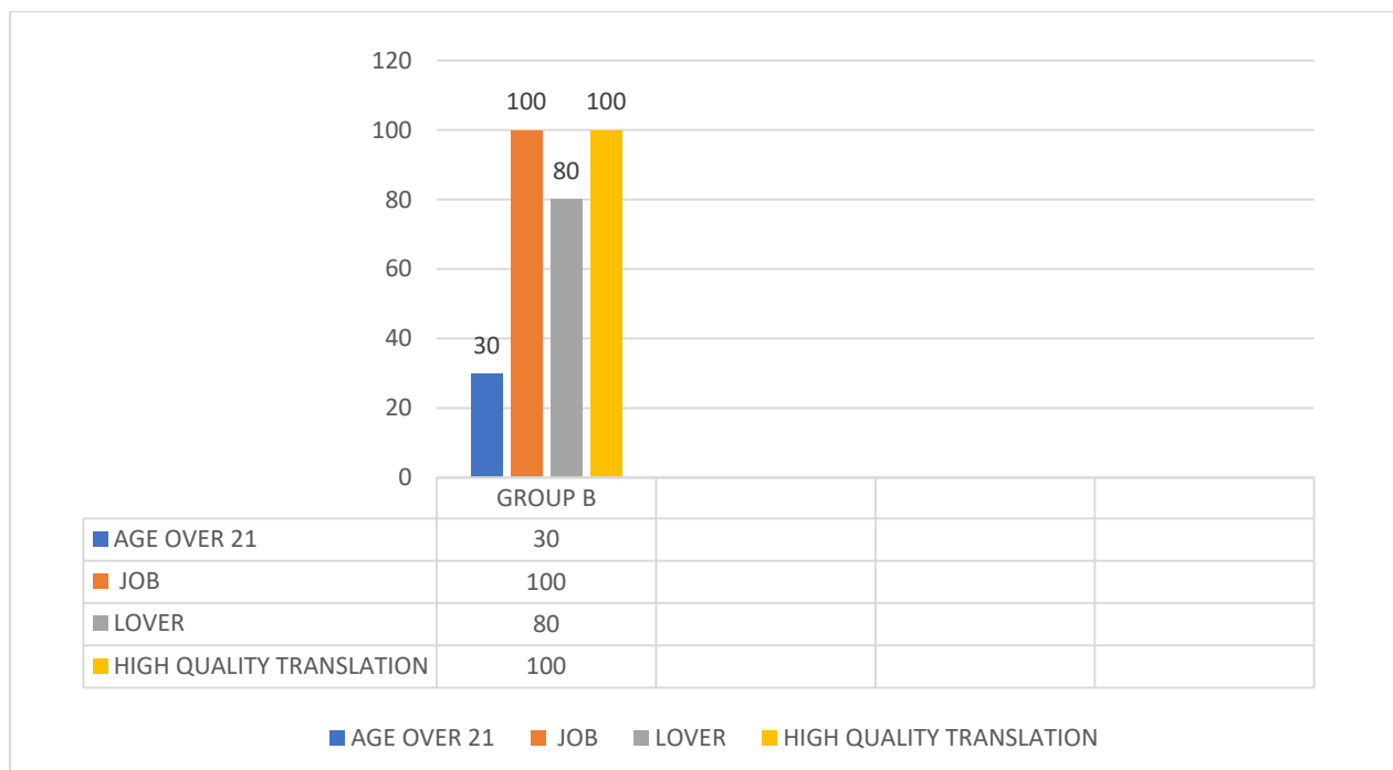
Figure 3. The Descriptions of Background Knowledge of Every Member in Group B

The results of the study indicate that background knowledge had a great effect on the quality of translation.