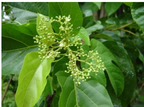
Figure 1. Leaves of Premna serratifolia L.

in Vietnam, Laos and Cambodia. In Vietnamese traditional medicine the leaves of this plant are used to treat indigestion, dysuria and dysentery. The roots are also employed against indigestion, stomachache and fever [2]. Previous phytochemical investigations on the Premna species reported the isolation and structural identification of a number of iridoid glycosides, polyphenols, flavonoid, coumaric acid and its derivatives, while there is no study on the bioactive constituents of P. serratifolia L [3, 4]. Here, in this study, chemical constituents of P. serratifolia and its cytotoxicity on human colon cancer cell DLD-1 are described.